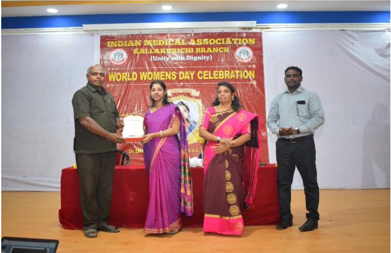
16. Women protect the wealth of the Country - Katchirayapalayam - 08.03.2022