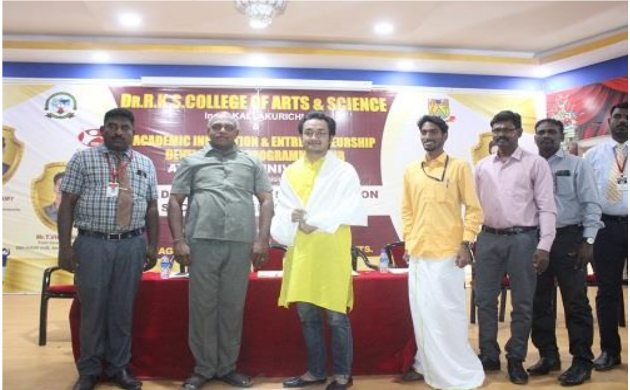
20. Plastic Eradication Oath Taking Programme – 31.03.2022 To 01.04.2022