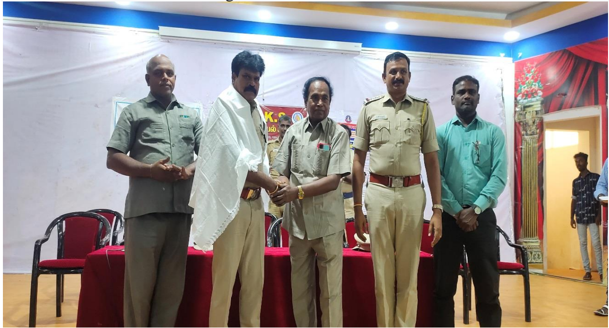
30. National Level Workshop Data Analysis Using SPSS - 26.05.2022