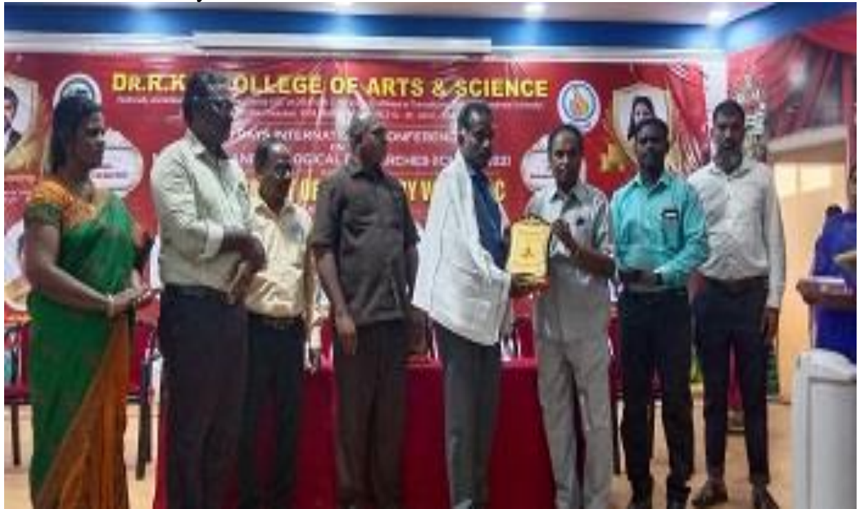
24. Life Skill Programme – 04.05.2022 To 06.05.2022