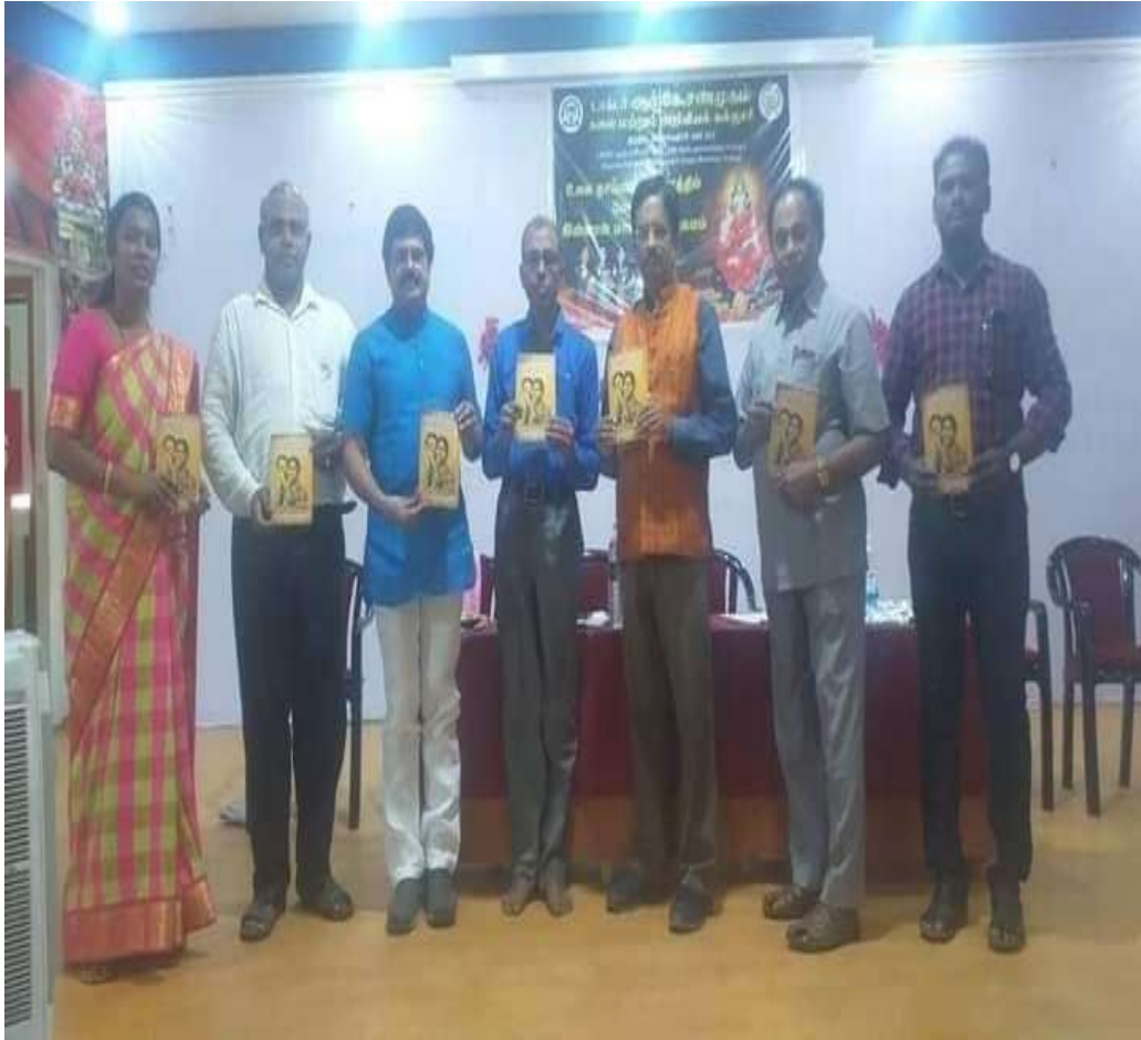
MOTHER TONGUE DAY - BOOK PUBLISHING FUNCTION