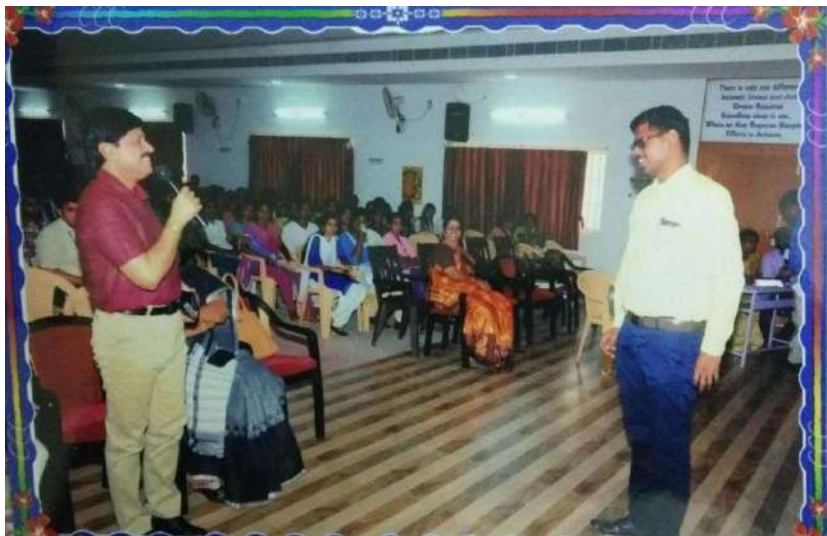
LANGUAGE AND COMMUNICATIVE SKILL