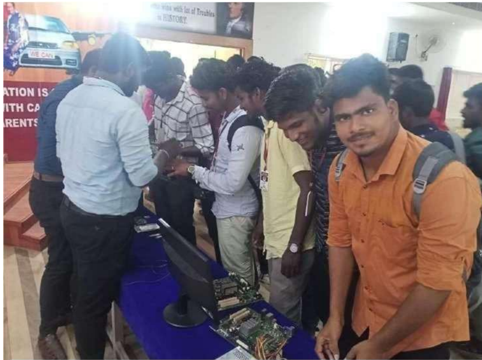
Hardware Virtualization (06.04.2022)