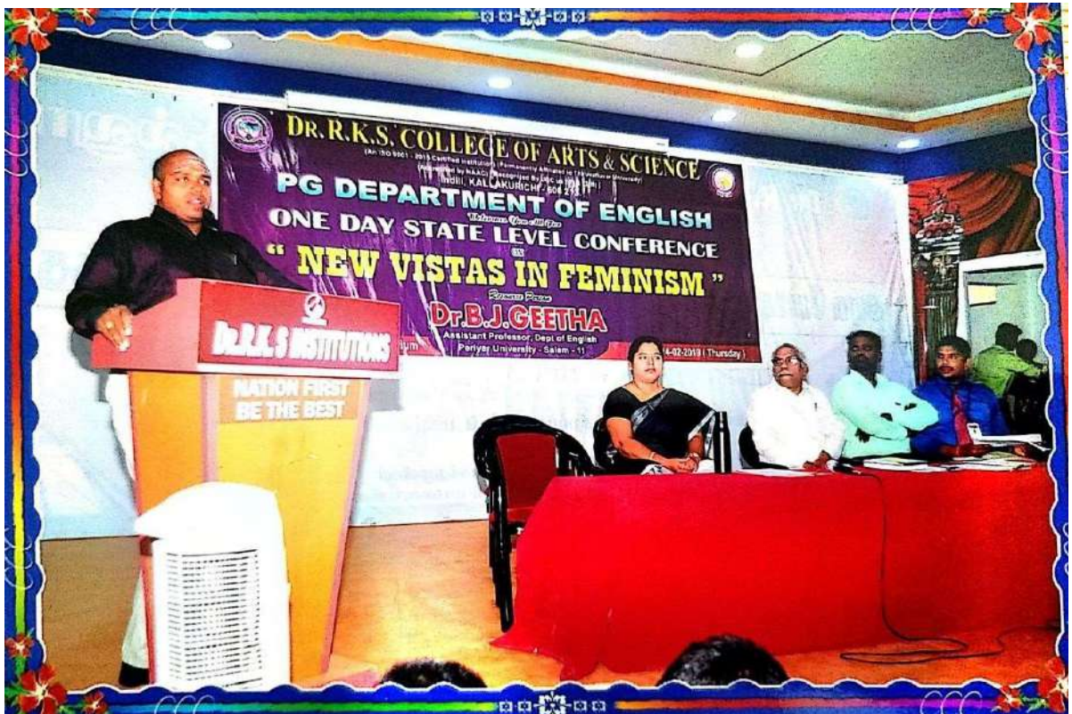
New Vistas in Feminism (14.06.2019)