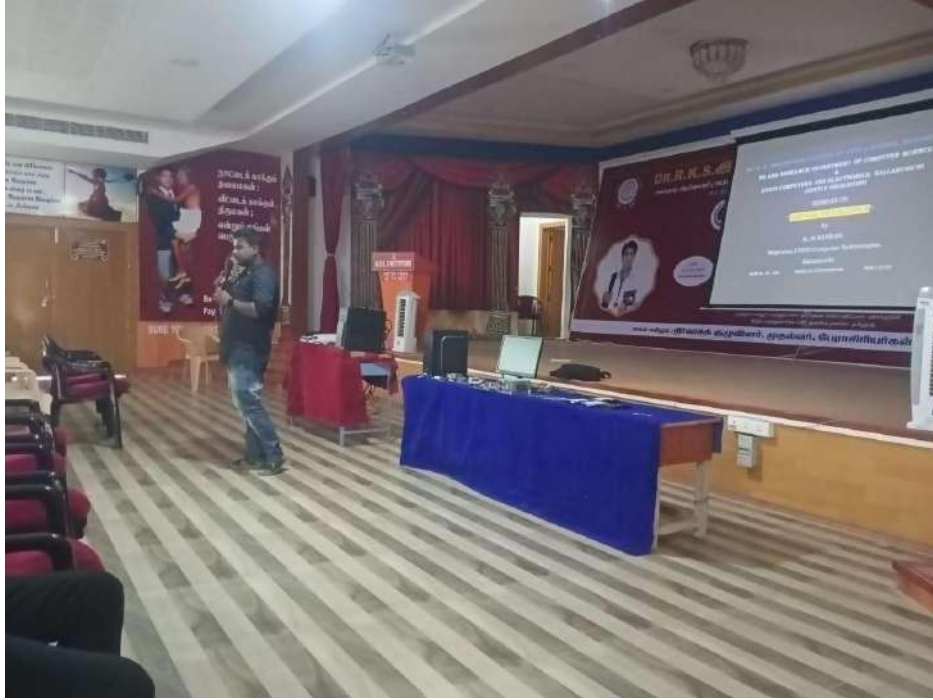
16.4.2022 Hardware Virtualization