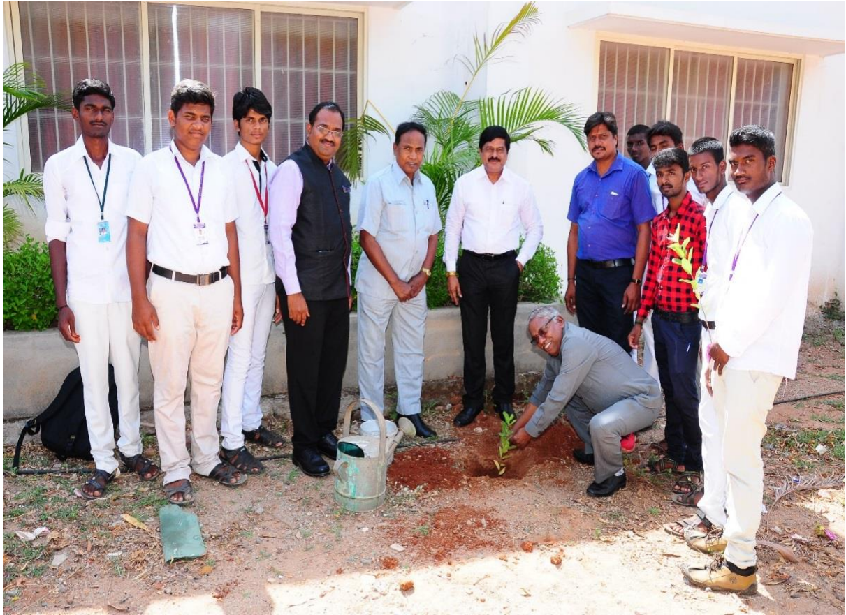
6. Tree Planting Function – 12.07.2018