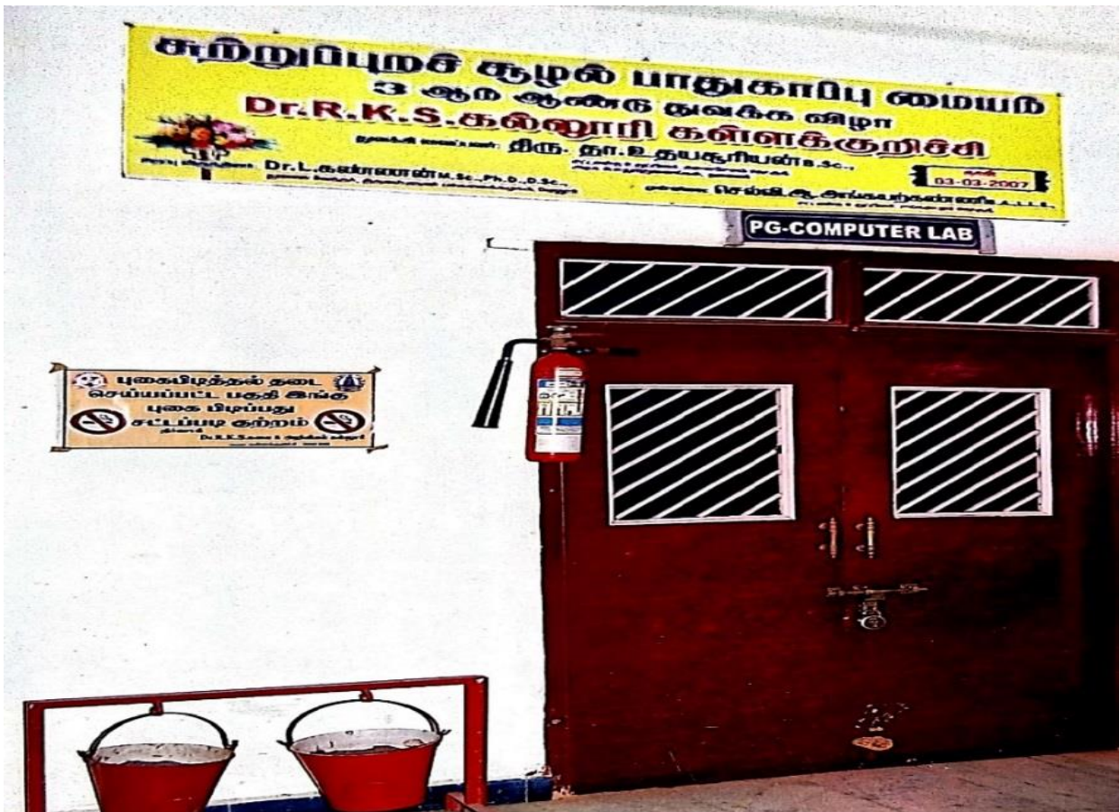
Environment Protection Centre for Protecting & Promoting the Green Campus