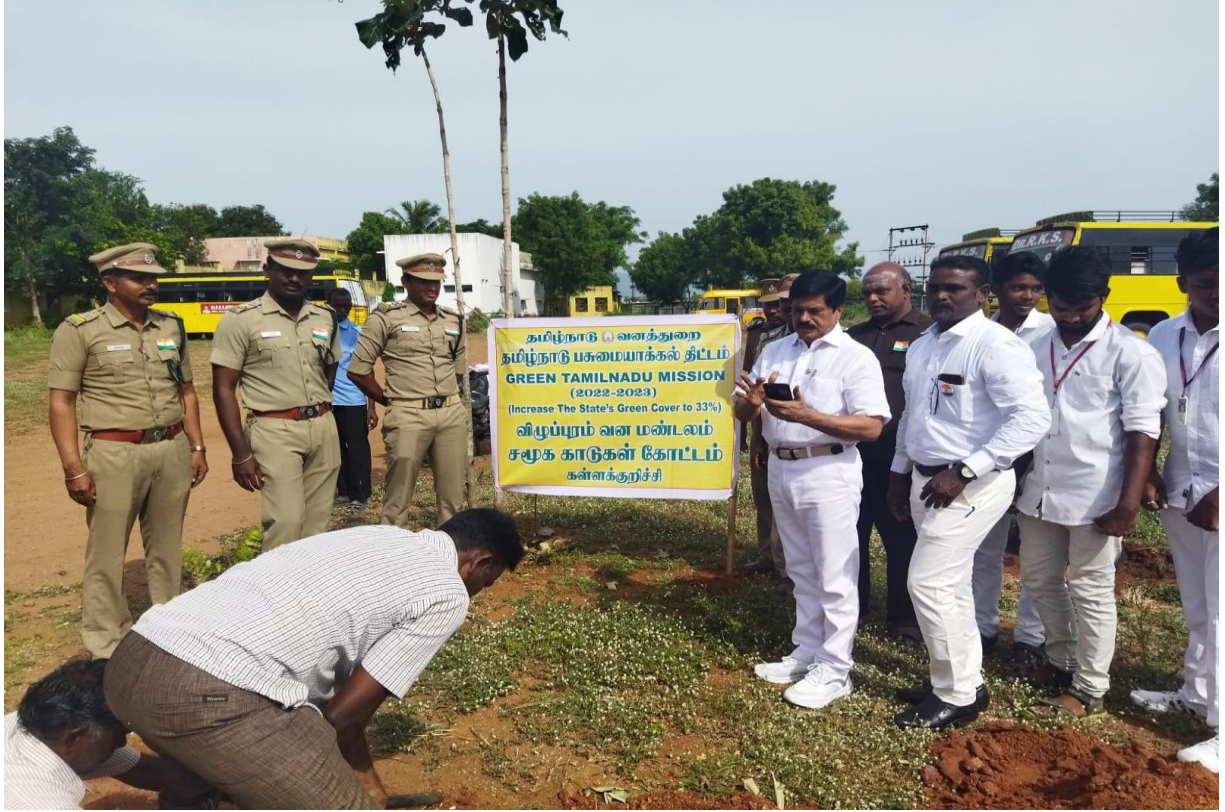
1. Tree Planting Festival – 15.08.2022