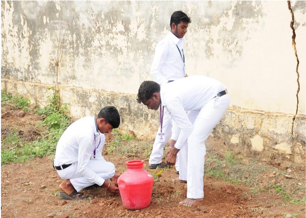
Tree Planting function – 12.08.2017