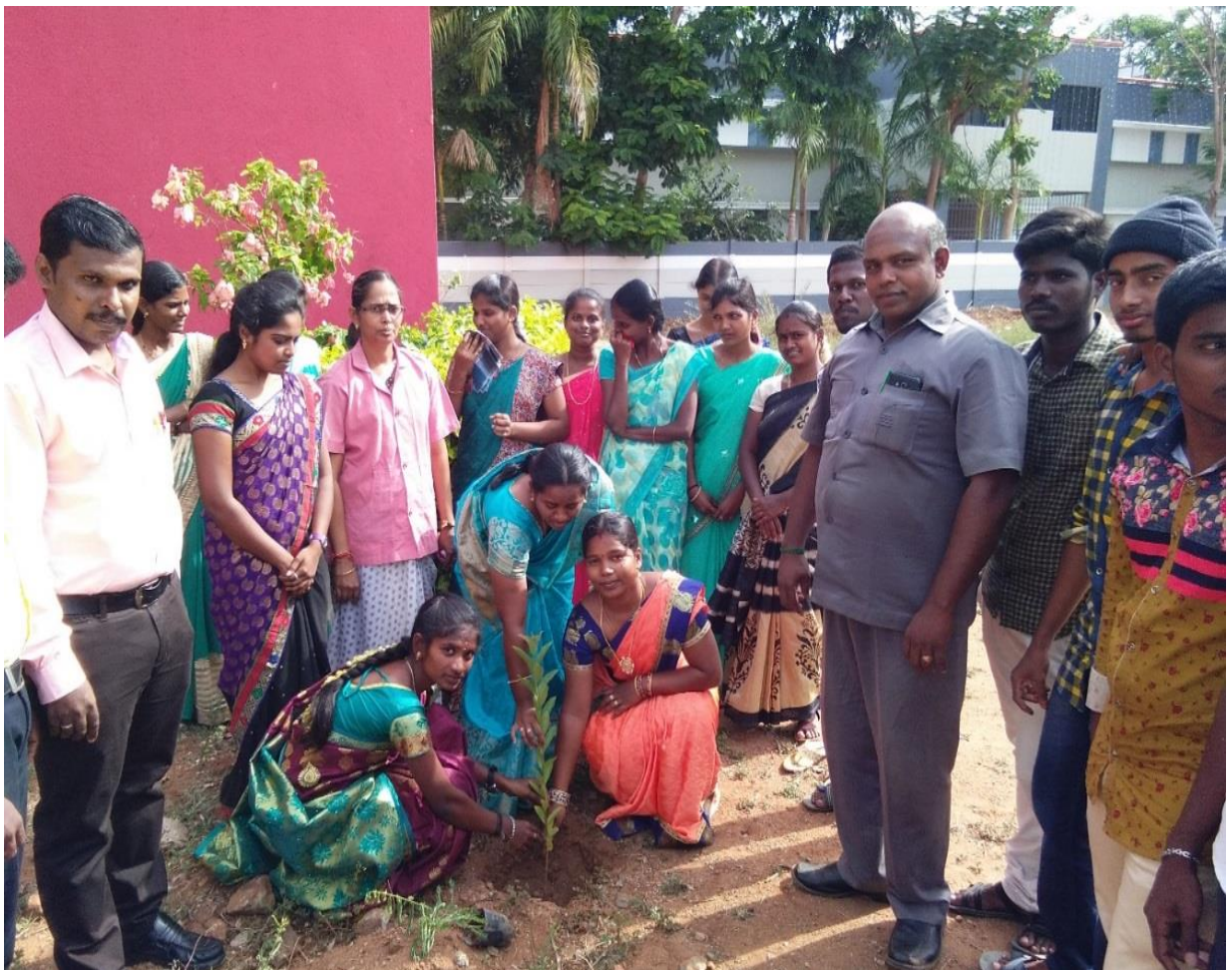
5. Tree Planting Function – 28.06.2018