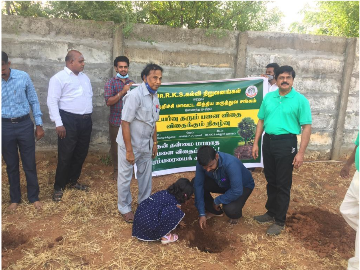
2. Palm Tree Sowing Ceremony – 29.07.2021