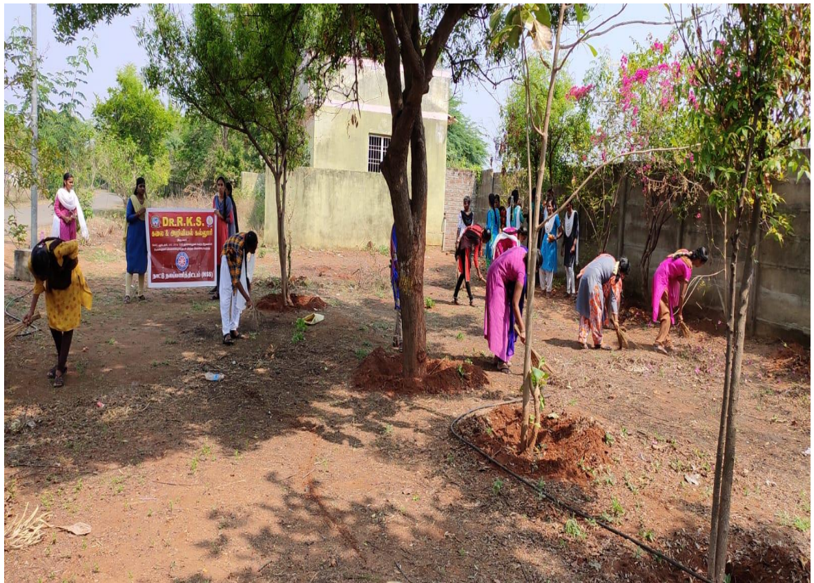
3. Environmental Promotional Activities by Cleaning the Campus (NSS Students) – April 2020