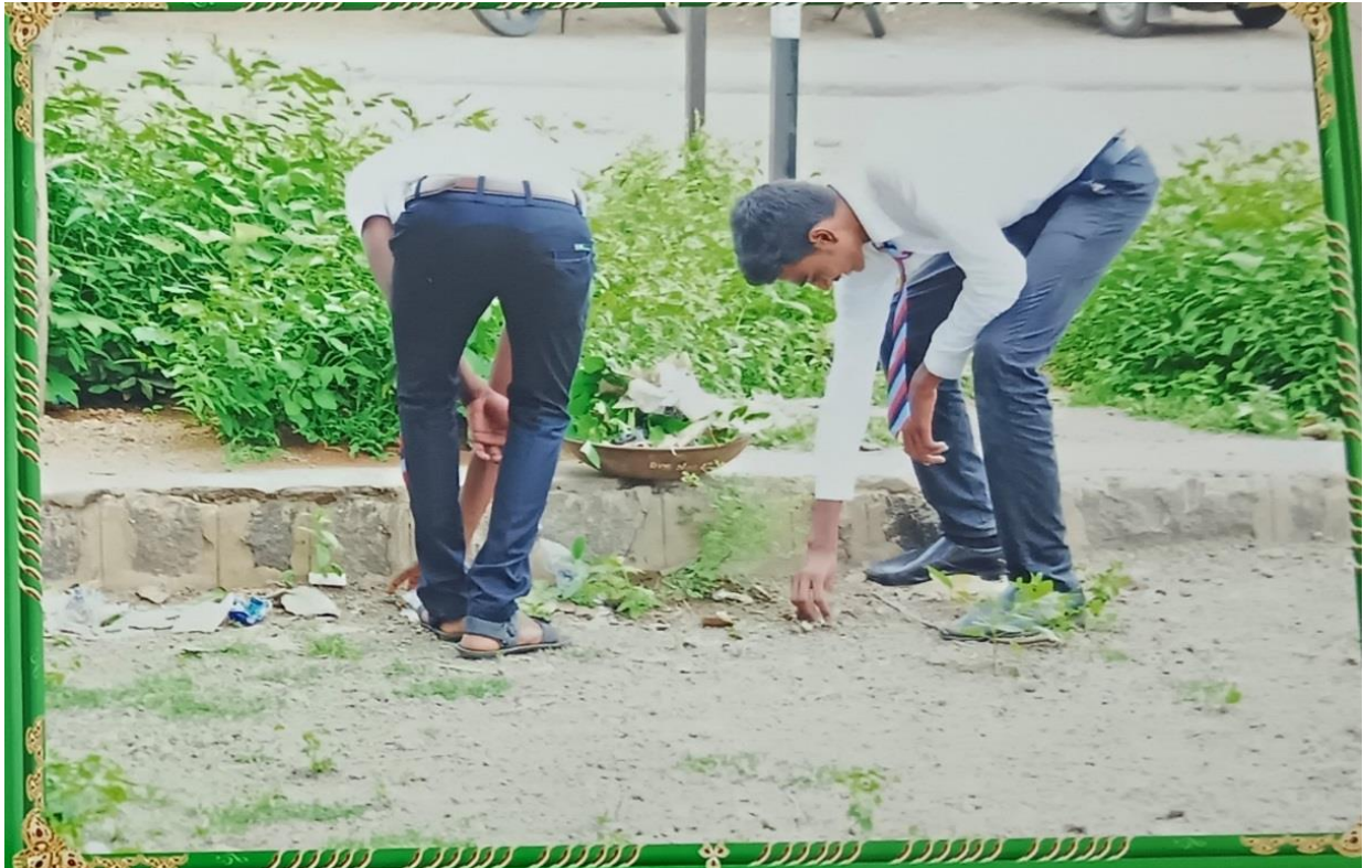
4. Environmental Promotional Activities by Cleaning the Campus through Volunteers (Our Students) – Sep 2019