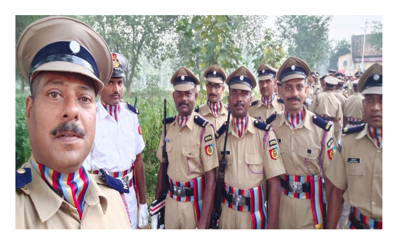
7. NCC PRCN Course Completed – at OTA Nagpur, Maharashtra – July to Sep 2021