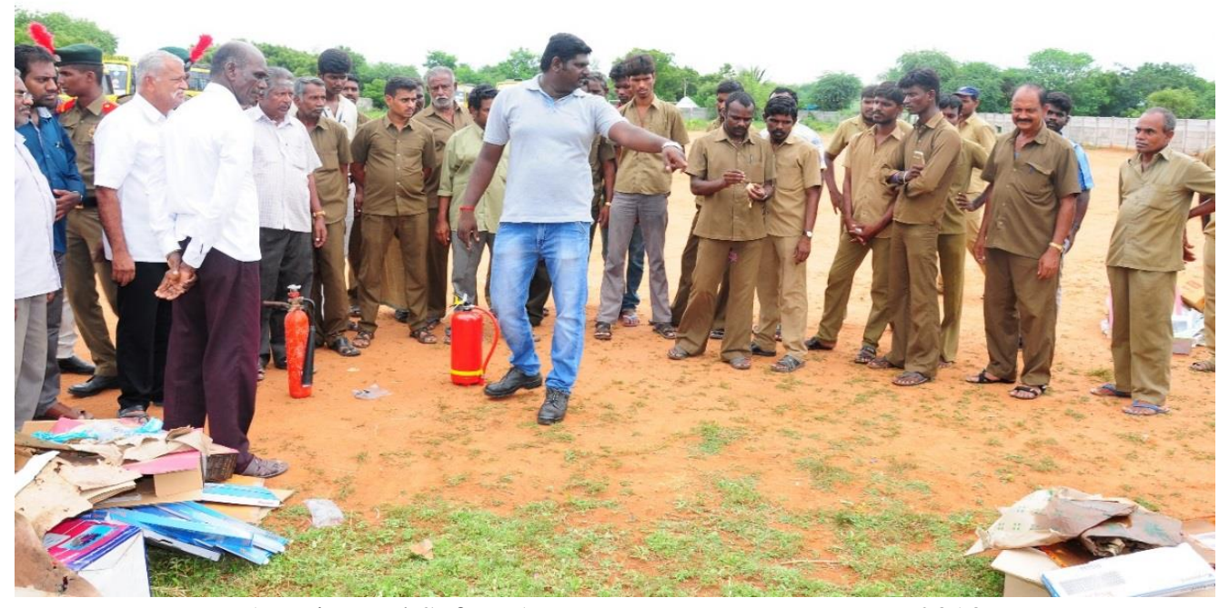
16. Fire and Safety Awareness Programme – Jan 2018