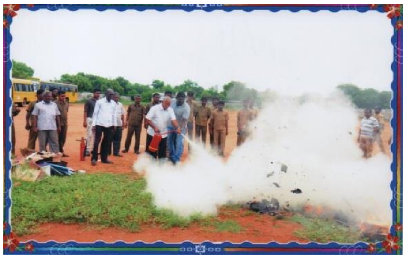
19. Fire and Safety Awareness Programme – Sep 2017