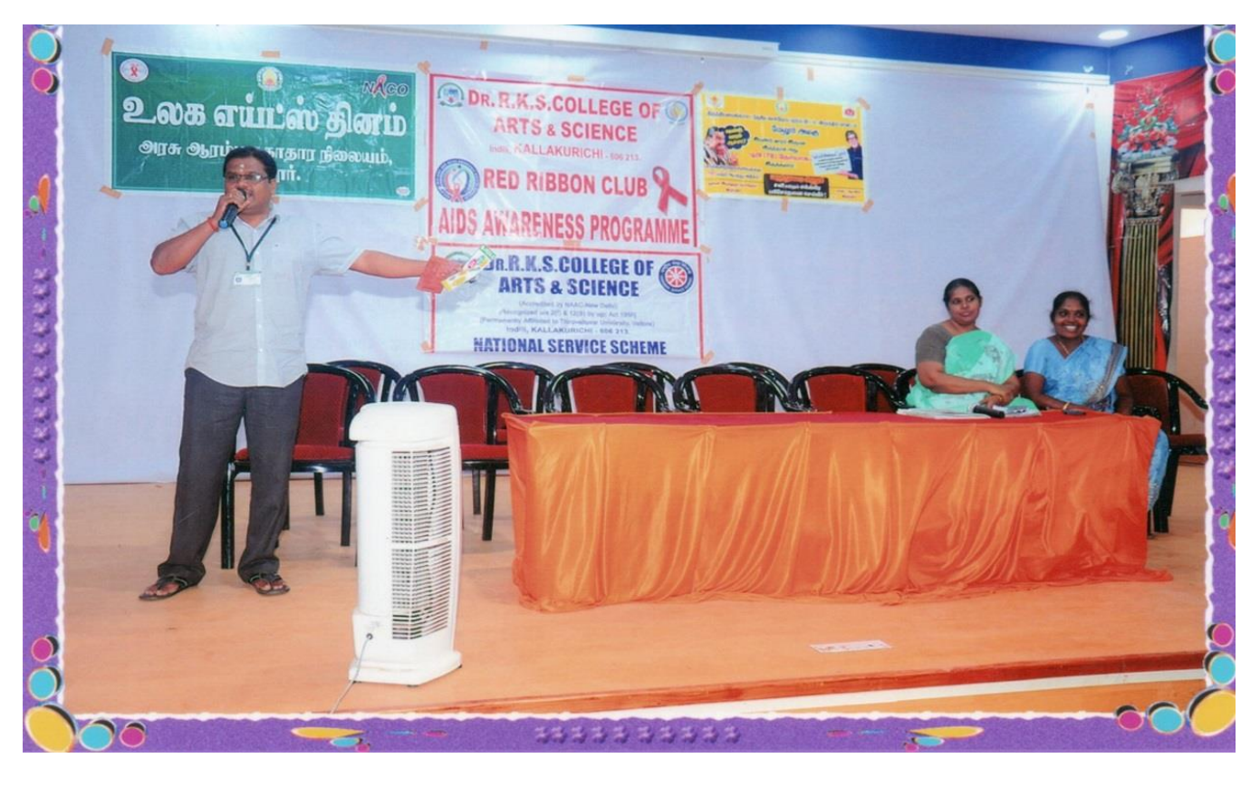
20. Aids Awareness Programme – Aug 2017